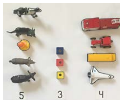
A student sorts by type and then matches a number to each group.