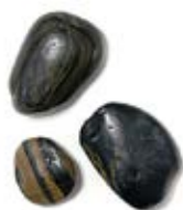
A student sorts by size and then counts how many in each group.